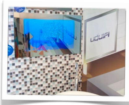
32" Full Mirror part of the built in series waterproof televisions