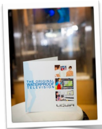
Printed 20,000 of these