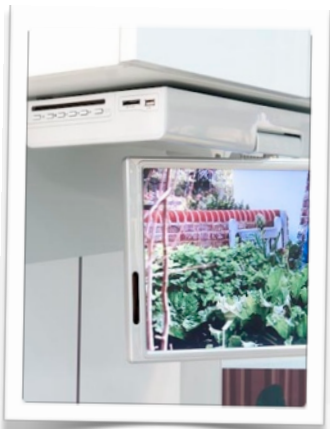
Launch of the 15.4" kitchen flip LCD TV