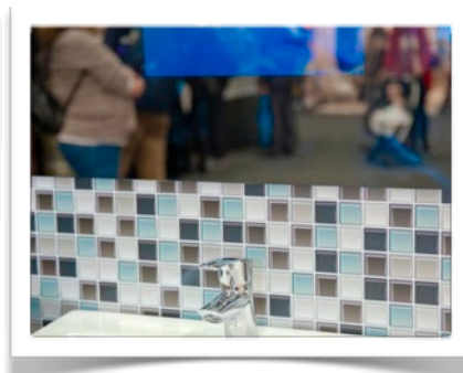
Custom mirror and TV