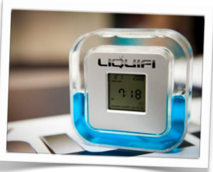
Free Liquifi clock for all purchases made at the stand over the 4 day event.