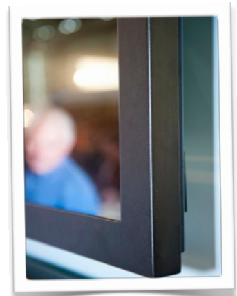
55" Elements series, side profile