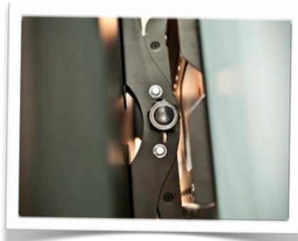
55" Full HD LED TV, ultra bright panel exhibited